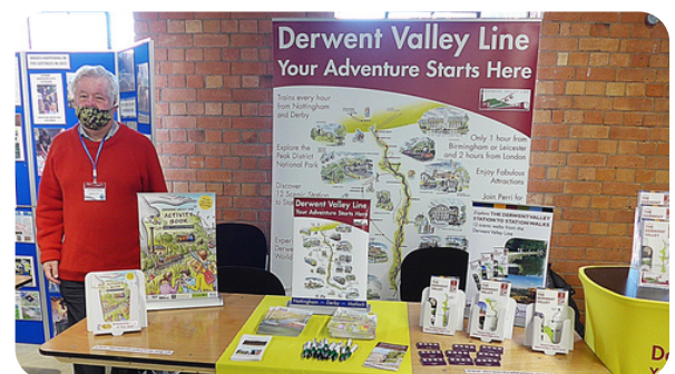
Promoting the line at Full Steam Ahead

Full Steam Ahead was held on 22 January 2021 at the Museum of Making, and featured various railway themed organisations celebrating the importance of the railway to Derby.