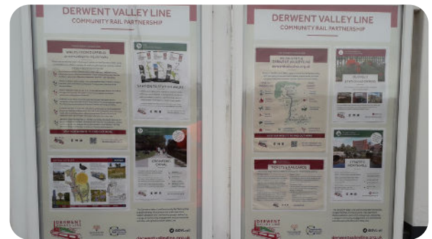
Derwent Valley Line Branded Information Displays

These enable a consistent style of marketing literature and communications to be produced including branded information displays providing a welcoming and informative set of posters at our stations.