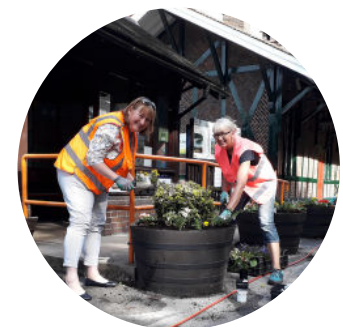
Matlock Bath station