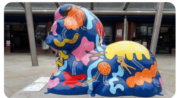
Community Rail Ram outside Derby station

Our ram was created by local artist Holly Aspinall and includes illustrations of places along the Derwent Valley and North Staffordshire Community Rail Lines. The Community Rail ram was jointly funded with East Midlands Railway.