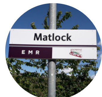
New platform signs

Additionally, Belper has benefitted from new directional signage providing clearer platform indication and wayfinding to local places of interest.