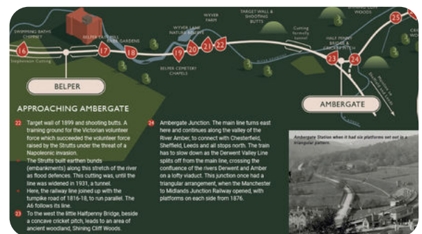
Views from the Train Window - an illustrated guide

The guide was produced by Derwent Valley Mills World Heritage Site and is featured on a dedicated page in the Your Journey section, of the Derwent Valley Line website.