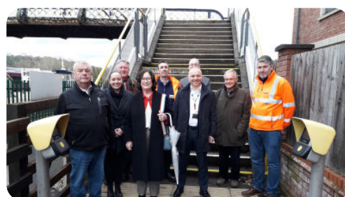
Meeting to discuss station access proposals

Pauline Latham MP for Mid Derbyshire attended the meeting at Duffield station to give her full support to the proposals and a range of letters and emails of support were provided to East Midlands Railway, for the funding bids to the Department for Transport's Access for All funding for 2024-29.