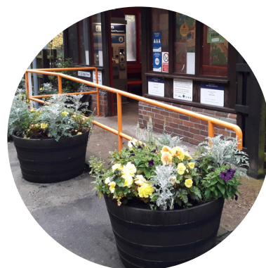
Matlock Bath station