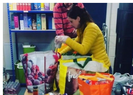
Jigsaw Foodbank, Matlock

At the start of the COVID-19 pandemic, East Midlands Railway provided funding of £1,500 to the Community Rail Partnership to support Rural Action Derbyshire's foodbanks in Long Eaton, Belper and Matlock. This funding helped to support increased demand on local foodbanks due to the additional financial difficulties that many people were facing. The funding from EMR helped purchase 'top-up' supplies for food parcels as well as helping towards the costs of operating home delivery services, such as vehicle hire and fuel costs.