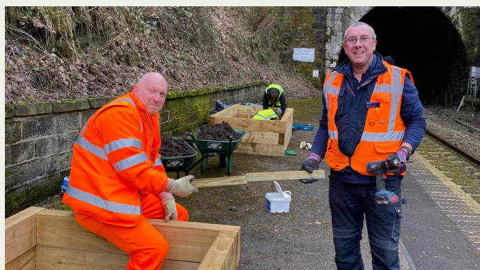
Building the Planters at Cromford station