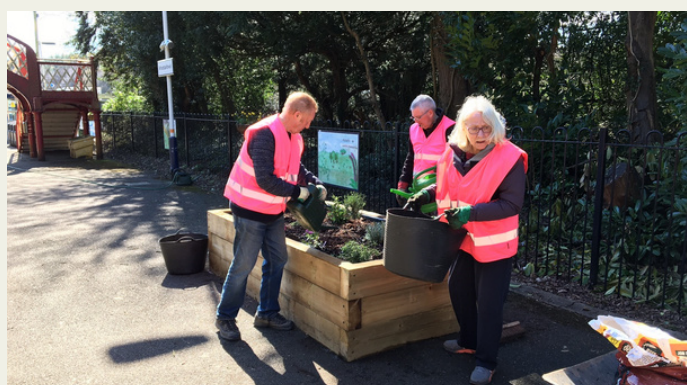
Station Adopters Planting Up at Whatstandwell station