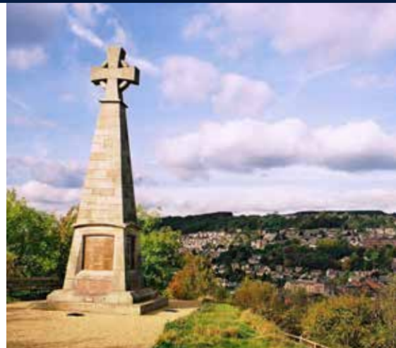
From Pic Tor War Memorial there are great views of Matlock, County Hall and Riber Castle