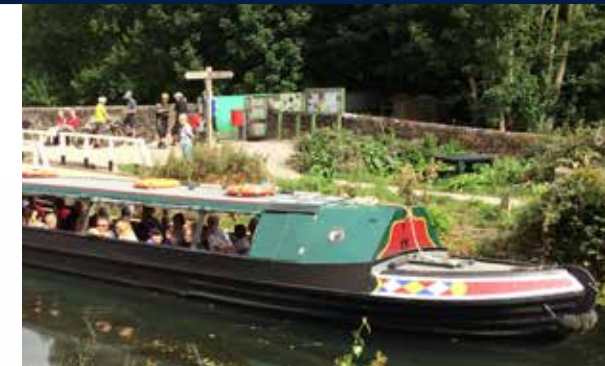
Canal Boat