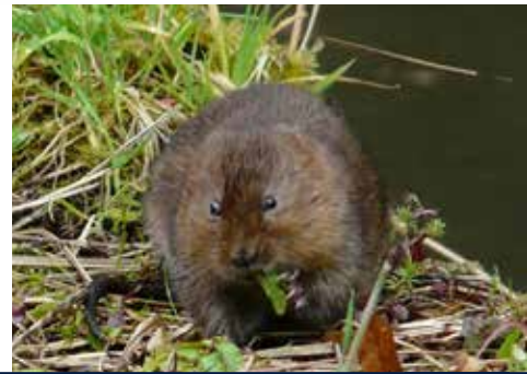
Water voles live along the canal banks