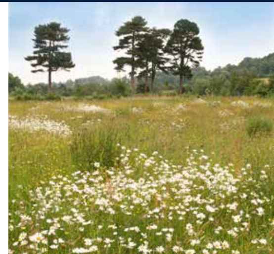
At Duffield Millennium Meadow look out for the seed pods resembling birds beaks.