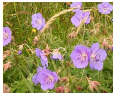
Marsh Cranesbill flowers here in spring & summer

Duffield Millennium Meadow sits at the confluence of the Derwent and its tributary the Ecclesbourne. This nature reserve was created by local residents to enhance the wildlife and beauty of the site. There are at least 3 different habitats that each support a variety of wildlife.