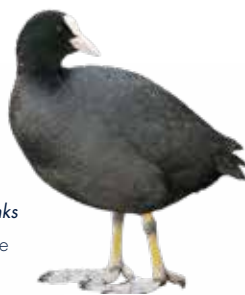
Look out for Coots along the river banks