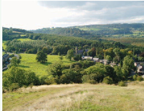
Looking towards Darley Bridge

In about 150 yards you need to turn right into Aston Lane. On your left you'll see a stile by a fingerpost. Go over the stile and head up the field, bearing right. There is no obvious path across the field but when you reach the trees (and a thicket of hawthorns) you should be able to pick out the path which leads up through the wood to some steps and a stile. Go over the stile and turn right. Bear left and immediately head up the bank through the gorse. At the top (by a waymark post) turn right and walk along the top of the ridge.