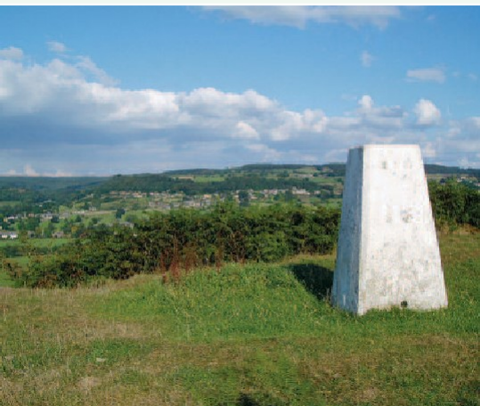
Triangulation point at Oker Ridge

the hill leading between Arc Leisure Matlock and the houses of The Dimple. Continue following the path across the end of a cul-de-sac by a recycling point. Keep straight ahead along the path, crossing over the next road. The path here is called Sheriff Lane. You will eventually reach a road called Hurds Hollow where you need to turn right. Walk downhill past the YHA premises along Dimple Road to reach the A6 at the bottom. Bear left here and follow the main road into Matlock centre to reach your starting point.