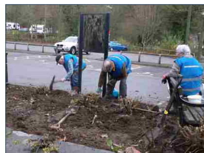
The station entrance area before and after clearance by Station Adopters

In August, Network Rail organised a team building event to clear vegetation encroaching on the busy footpath linking Matlock Bath Station to the Heights of Abraham. A team of eight from Network Rail, East Midlands Trains and the Rail Partnership cleared both sides of the footpath of overhanging vegetation, brambles and nettles. Many appreciative comments were received during the day.