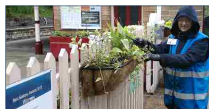
Caring for one of the planters at Matlock Station

Eight volunteers from the Station Adoption team assist in the weekly plant care and watering sessions which maintain the planters to such a high standard throughout the year. There are now over 20 planters and flower baskets all expertly cared for throughout the year and greatly appreciated by passengers using the station.