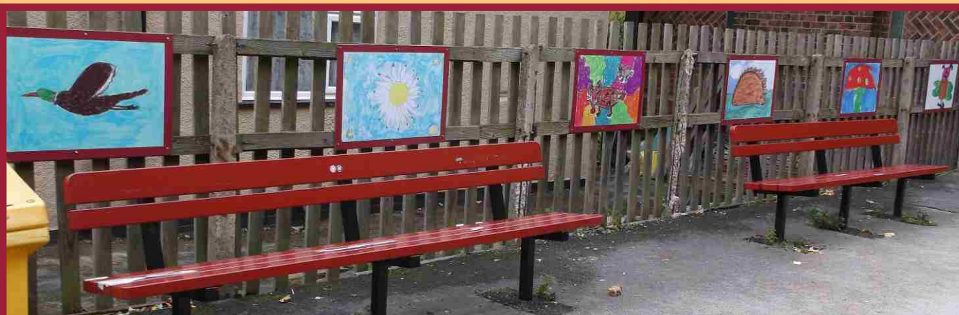
Children's artwork at Matlock Bath Station.