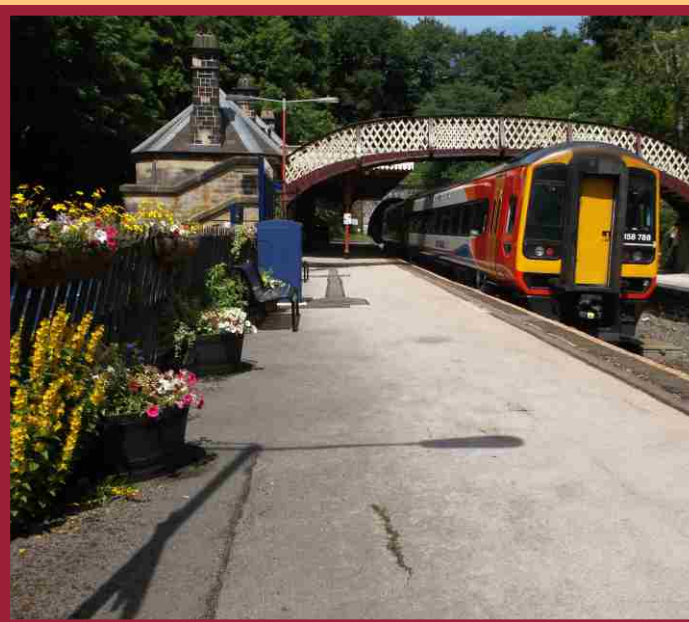
Planters at Cromford Station