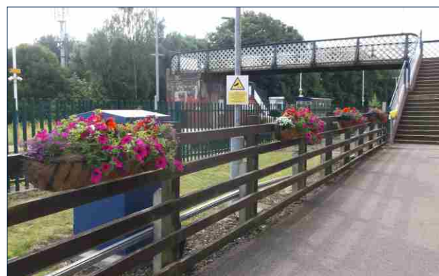
A colourful display at Duffield Station

The small team of Station Adopters continue to ensure colourful floral displays in the flower baskets along the entrance path and in the larger platform planters. The volunteers, who are members of Ecclesbourne Valley Railway, also maintain the planting areas on the adjacent heritage railway station.