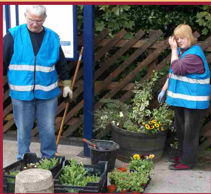
Station Adopters planting at Ambergate.