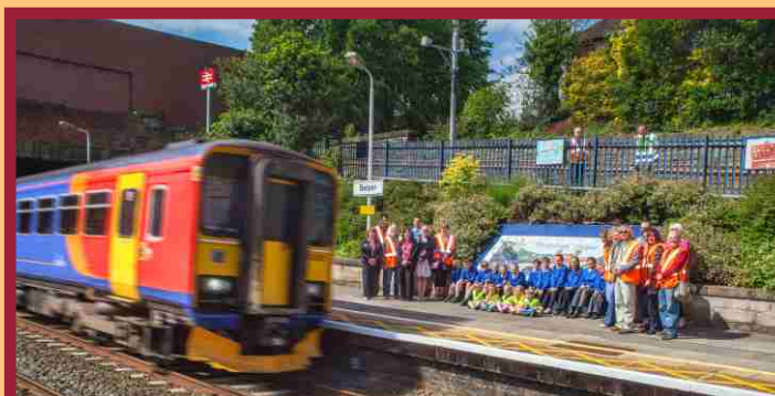
'Launch of Belper Station Mosaic' Ashley Franklin's award winning photograph. See pages 3 and 4 inside.