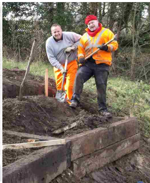
East Midlands Trains staff creating terraced planting area on large banking next to steps