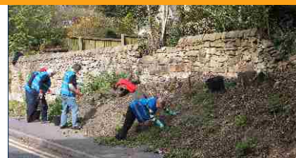
Ground clearance at station entrance

The station entrance is gradually being improved following the removal of invasive Laurel. The large areas which had been dominated by Laurel have been planted with various woodland species including 1,000 native Bluebell bulbs and sown with wildflower seeds. This work was carried out by the Cromford Station Volunteers assisted by the DerwentWISE team, who also funded the purchase of the woodland wildflowers with a grant of £495. The Bluebells have proved successful as have some of the wildflowers. Throughout the rest of the station the adopters have been removing brambles and weeds, whilst cutting back vegetation throughout the year and maintaining the seasonal bedding plants on the platform. The improvements at the station have prompted much local praise and the station won the Environment Award 2015 at East Midlands Trains Best Station Awards.