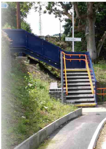
Before and after: Small section of banking improved by Station Adopters

The access improvements and work of the Station Adopters led to Ambergate winning the Most Improved Station Award 2015 at East Midlands Trains Best Station Awards.